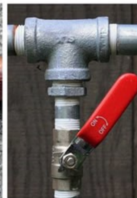
Galvanized Steel & valve